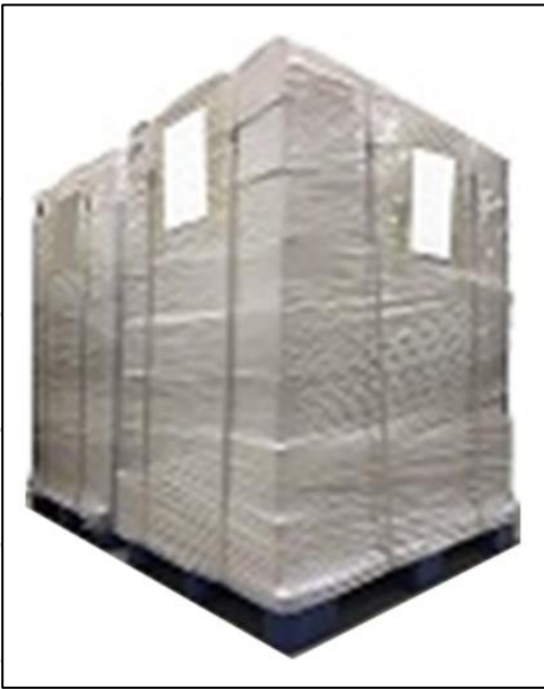
Pic No. 4

Wrapped with yellow tape after wrapping black protective film