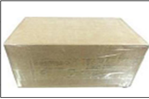
Pic No. 2